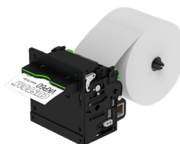
VKP60 paper mouth with roll holder and dongle ETH