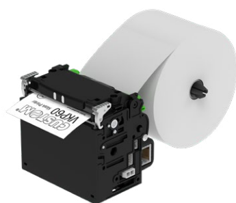
VKP60 compact with roll holder and dongle ETH