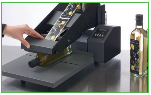
With the built-in LED display users can easily set-up variable spacings, save up to nine different container offsets and see the number of applied labels.