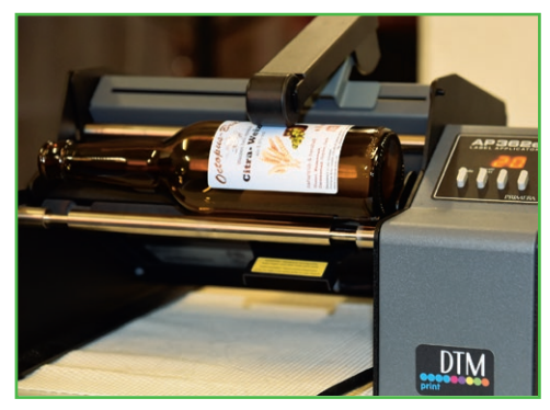
AP362e in action at the Swiss brewery "Octopus"

More information Scan the QR code to see all videos related to the applicators.