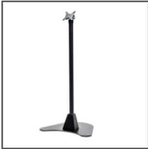
mUNITE FLOOR KIOSK STAND BLK & WHT BLK 37954700 WHT 37954690 Tablet Kiosk Stand, 45-Inch Height, Floor Stand