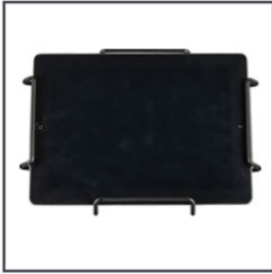
mENCLOSURE UNIVERSAL BLK & WHT BLK 37950830 WHT 37950850 Tablet Enclosure, Universal, mUnite Compatible, 100mm VESA, Lock Key