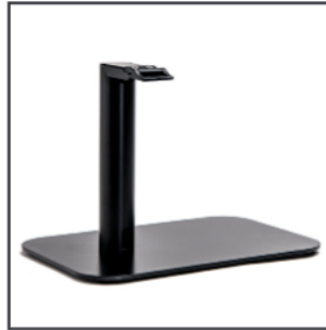
mUNITE EZPOS STAND BLK & WHT BLK 37954710 WHT 37954700 Tablet Stand