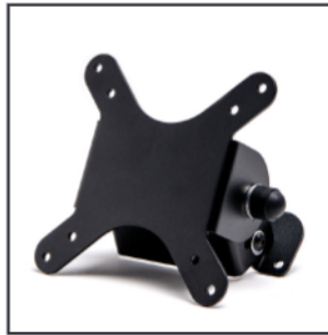
mUNITE WALL MOUNT BLK & WHT BLK 37954620 WHT 37954610 Tablet Wall Mount