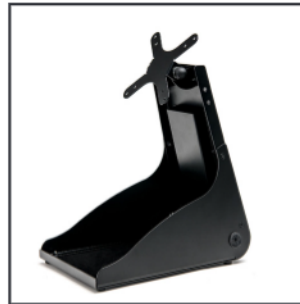
mUNITE EZ100 BLK & WHT BLK 37954780 WHT 37954770 EZ100 Desk Stand for Star TSP100, TSP650 or TSP700 Series