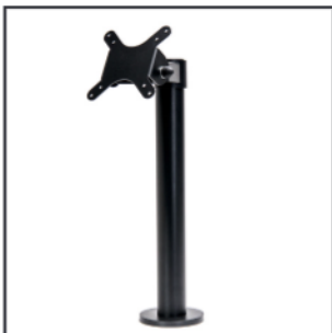
mUNITE 18 MOUNT BLK & WHT BLK 37954820 WHT 37954810 Tablet Mount, 46cm Pole, Counter Top & Edge Mount, Installation Kit Included