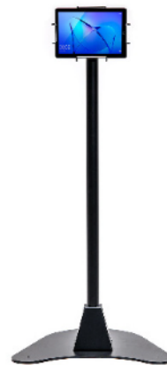
Floor Kiosk Stand Tilt: +90°, -10° WxDxH: 474 mm wide 573 mm deep 1179 mm high Weight: 8.5 Kg