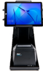
EZ100 Tilt: +45°, -45° WxDxH: 176 mm wide 268 mm deep 340 mm high Weight: 4 Kg