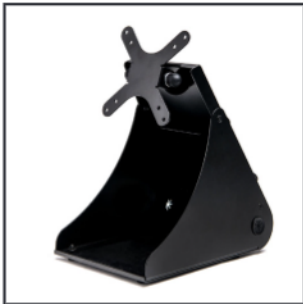
mUNITE EZ3 STAND BLK & WHT BLK 37954760 WHT 37954750 Tablet Stand, mC-Print3 Series, includes Customer Facing Display Mount