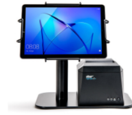
EZPOS Tilt: +45°, -45° WxDxH: 300 mm wide 200 mm deep 206 mm high (To top of post) Weight: 2.28 Kg