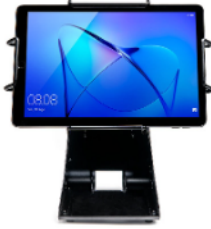
EZ3 Tilt: +50°, -5° WxDxH: 162 mm wide 229 mm deep 280 mm high Weight: 3.8 Kg

Freshen your point-of-sale with Star's wide selection of mUnite desktop tablet stands. Keeping cables together and off the checkout counter, these upscale stands are made to house and protect a variety of Star printers, providing stability and style. They use universal VESA mounting to secure the tablet of your choice, giving the freedom to tilt the screen while including room for a second customer-facing option. Stylishly space-saving, Star's desktop stands present a clean and attractive look to your customers. * Tablet, enclosure and printer not included