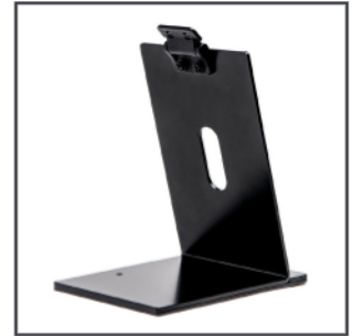
mUNITE EZDESK KIOSK STAND BLK & WHT BLK 37954740 WHT 37954730 Tablet Kiosk Stand, Compatible with mEnclosure Universal Only