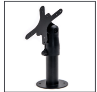
mUNITE 7 MOUNT BLK & WHT BLK 37954800 WHT 37954790 Tablet Mount, 18cm Pole, Counter Top Mount, Installation Kit Included