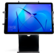
EZDesk Tilt: +115°, -15° WxDxH: 150 mm wide 221 mm deep 183 mm high Weight: 2.28 Kg EZDesk can be mounted for secure installation.

With the mUnite EZ Desk Kiosk and Floor Kiosk stands, Star Micronics has created two sturdy yet easy-to-move tablet displays built for any self-service or customer engagement application. These stands are free-standing with weighted bottoms to keep them firmly in place. Presenting an attractive minimalist design, Star's kiosk stands can be used in any retail or hospitality environment, allowing customers to check in or place orders independently or used for visitor management or customer information. *Tablet, enclosure and printer not included