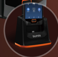
Optional single charging stand