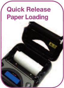
Quick Release Paper Loading