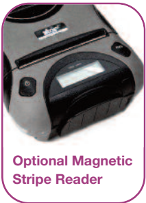
Optional Magnetic Stripe Reader