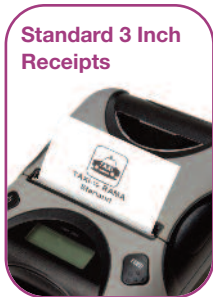
Standard 3 Inch Receipts