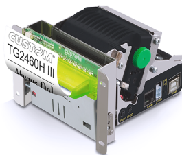
915CG040200300 PRINTER TG2460HIII USB RS232 CUTTER