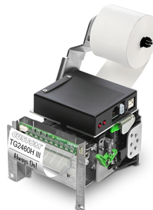
915CG040400300 PRINTER TG2460HIII USB RS232 CUT EJECTOR