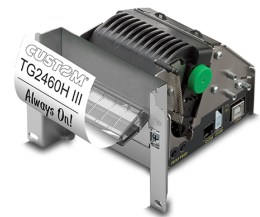
915CG030141300 PRINTER TG2460HIII USB TEAR OFF TRASP. BEZ