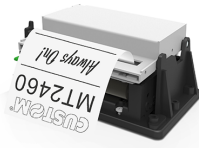
917EF051800000 PRINTING MECHANISM MT2460 CUT+VERT SUPP