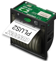
915CW100300022 MECHANISM PLUS2