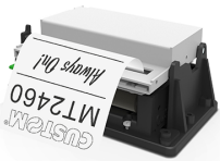
917EF051700000 PRINTING MECHANISM MT2460 CUT+HORIZ SUPP